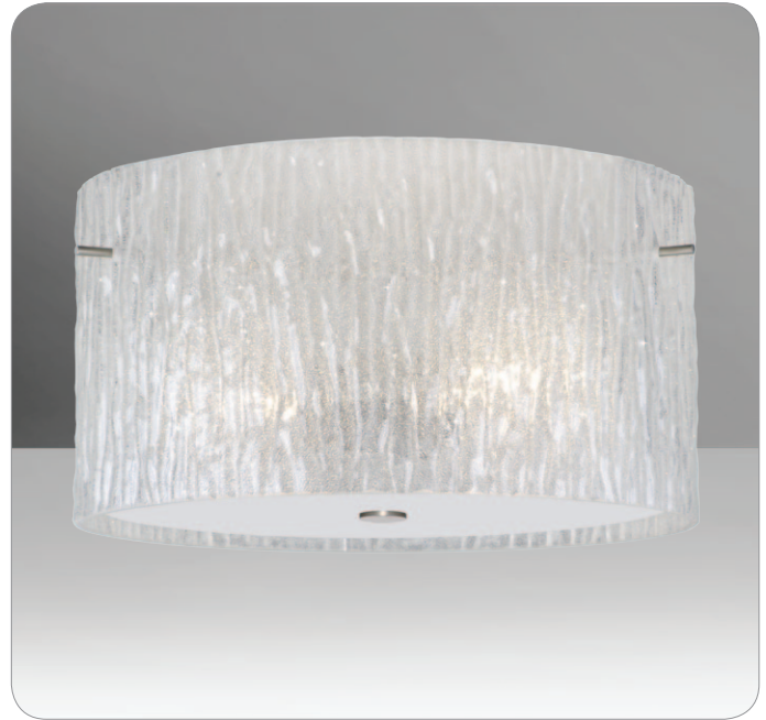
TAMBURO 16 CEILING SHOWN IN GLITTER STONE (4008GL)

UL or ETL Listed. Suitable for Damp Locations (interior use only).