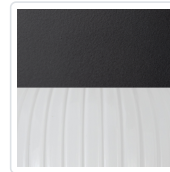
Matte Black/Glossy Ribbed Opal Glass (MBGR)

* For custom options, contact customer service.